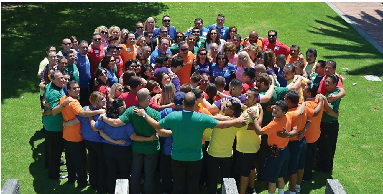
Camden's tight-knit culture