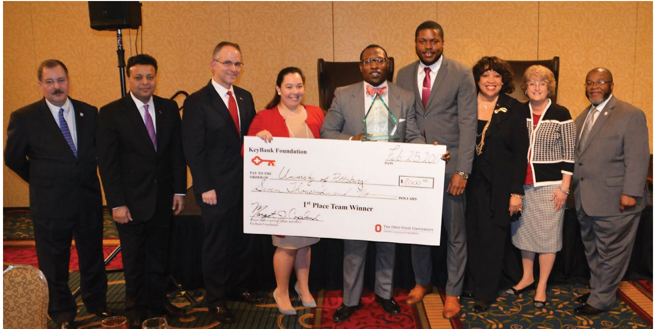
KeyBank Foundation and The Ohio State University partnered to host the 13th annual KeyBank and Fisher College of Business Minority MBA Case Competition in Cleveland, Ohio.