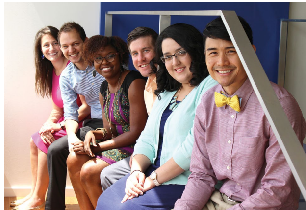
Camden’s future leaders

Because Camden hires and promotes internally based on a team member’s demonstrated abilities, the firm appeals to female candidates. They can be confident in the knowledge that their career progression will be