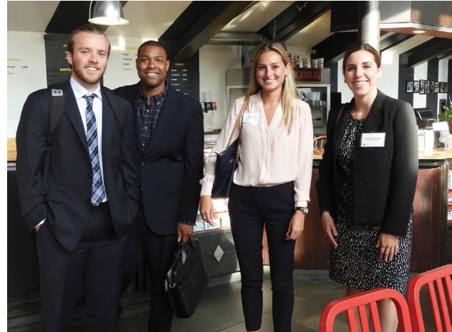
Attendees at the showing of the movie, Girl Rising, sponsored by the Miles & Stockbridge Women’s Network and the firm’s Social Impact Committee.

Law360, a legal news service, ranked Miles & Stockbridge second in the nation in 2016 on its list of “Best Law Firms for Black Attorneys.” The American Lawyer , a monthly magazine for the legal profession, recognized Miles & Stockbridge as one of the firms on its 2017 Am Law 200 list with the highest percentage of African-American attorneys. In the spring of 2017, the firm was one of six finalists from around the country honored for diversity efforts by a large financial institution client.