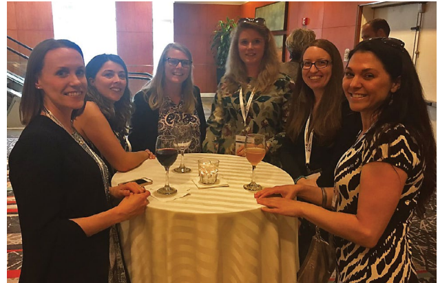
Female attendance hit nearly 40% at SVN's national training session for brokers in Chicago in 2017.