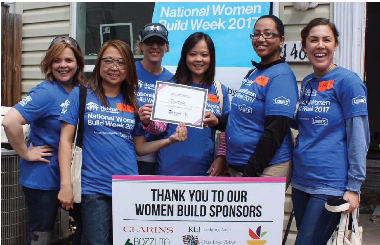
Women of Bozzuto Construction Company volunteer at National Women Build Week 2017