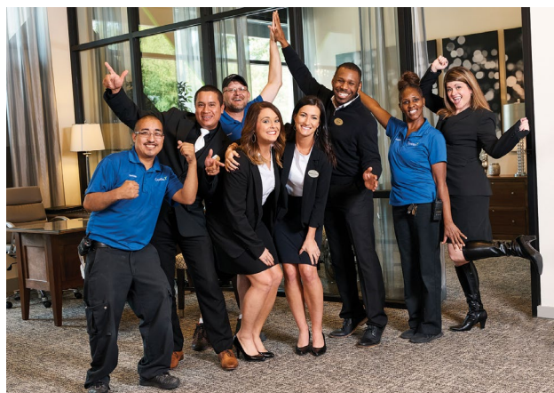
Camden’s front line employees love taking care of their customers.

A few examples of how Camden has supported this philosophy is increasing diversity on its board of