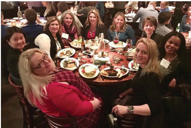
The Women’s Networking Forum provides an atmosphere where CBRE women can meet to share best practices, explore new ideas, and build their business skills.

Employee networking groups are one of CBRE’s key diversity initiatives, and the Women’s Network is only one of seven. Additional groups are: African-American Network Group, Asia Pacific Network, CBRE Military,