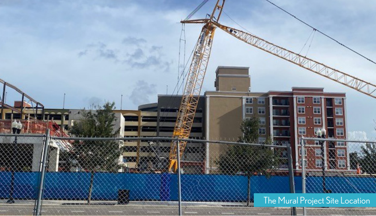
The Mural Project Site Location