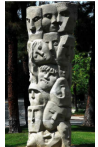
Tower of Masks sculpture