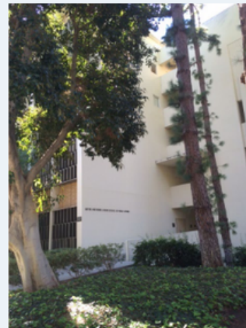
Luskin Public Affairs building side door