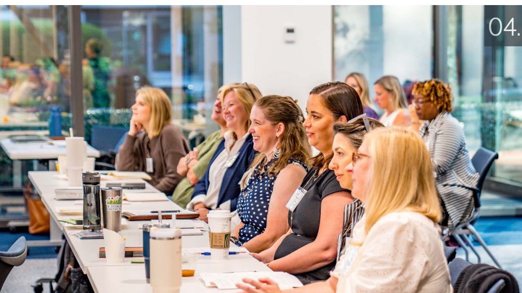
01. Empowerment Speaker Series with Dr. Suzy Welch, September 2025; 02. Potential New Member Event, August 2025; 03. Canvas and Connections Dine Around, September 2025; 04. CREW Leadership Alumni Symposium, September 2025; 05. Mix & Mingle with the Board Dine Around, August 2025