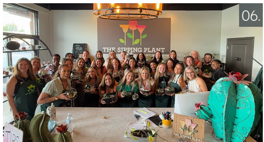
01. CREW Atlanta's Annual Charity Golf Classic, April 2025; 02. CREW Hype Happy Hour, May 2025; 03. Asian Bites & Culinary Delights Dine Around, May 2025; 04. Program: Straight Talk in Shaky Times, June 2025; 05. Pickle and Mingle Dine Around, June 2025; 06. One Plant, One Pour at a Time Dine Around, July 2025